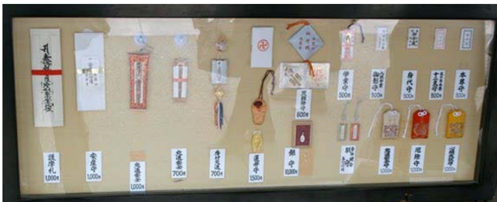
Lucky Charms at Sensō-ji temple in Asakusa, Japan

In December of 2016, I visited the Sensō-ji temple in the Asakusa district of Taito, Tokyo Japan. There I saw a plethora of lucky charms which supposedly can ward off all kinds of invisible evil spirits which haunt audiophiles. Just when I was about to purchase a Sensō-ji charm, my travelling companion suggested for me to look into a weapon called the Acoustic Revive Schumann Pulse Generator RR-888.