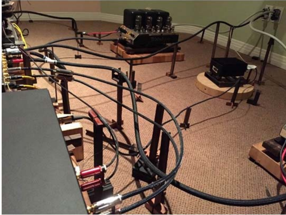
(Cable Risers deployed at the Leevite Residence)

clan can see. The evil spirit sent vibrations from the earth to the interconnect cables upon which they rest, causing degradation to the audio signal. To ward off the spirit, the Leevite deployed a weapon called Cable Risers, an intricate array of Macassar Ebony supporting columns which resembles the Batman Roller Coasters of Six Flags Theme Park in Texas, upon which the Vibratomous Terram Spirit departed hurriedly and never returned. To this day, I remain unconvinced of the presence of such a spirit, yet the Leevite swore upon his elder's grave of its existence. [L] [SEP]