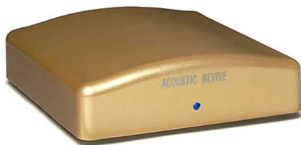
(Acoustic Revive Schumann Resonance Generator)

Of all the mortal enemies of the middle earth, there is but one specific kind of ferocious creature which targets all Vinylphiles indiscriminately, it is none other than the much dreaded "Static Goblin". The Static Goblin comes and goes without warning, but they seem to be prevalent more so in winter months when the air is dry and food is scarce. When an attack is launched, the Goblin will cause "Snap, Pop and Crackle" to the sound of vinyls during play, and it can also turn vinyls into a magnet for dust.