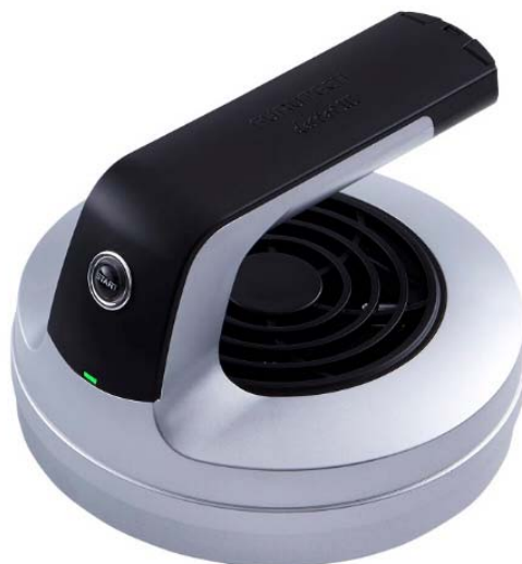
(Furutech Destat III)

There exist, however, a weapon made by Furutech called the Destat III (US$ 390). It is available through Audiyo.com. The battery-operated curling-ball like device is essentially an ionizer with a built-in electric fan. It blows ionized air onto the LP surface which will ward off Static Goblins which have invaded the record surface. The weapon is quite effective, but its deployment resembles a religious ceremony which will draw puzzling looks by ordinary civilians of Middle Earth who may cry afool of the process, mistaking as witchcraft.