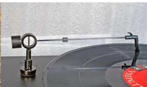
Rek-O-Kut Dust Bug Anti-Static Dust Remover

The SK-Filter looks remarkably similar to the Rek-O-Kut Dust Bug Anti-Static Dust Remover, but unlike the Rek-O-Kut, the actual Brush on the SK-Filter is set a level 1mm above the record surface and never comes into contact with the LP. Just like the SK-EX-III, the SK-Filter wards off the Static Goblin by using Thunderon®. The copper sulfide bonded acrylic fibers are said to be exhaustively